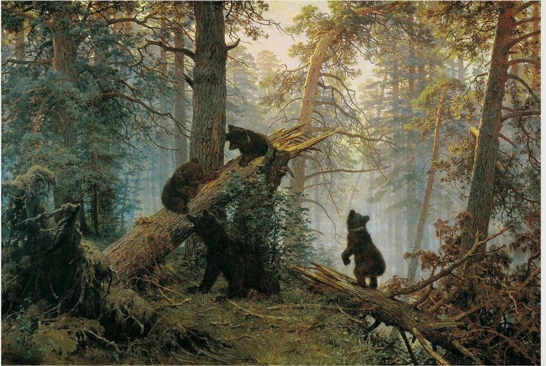
Morning in a Pine Forest