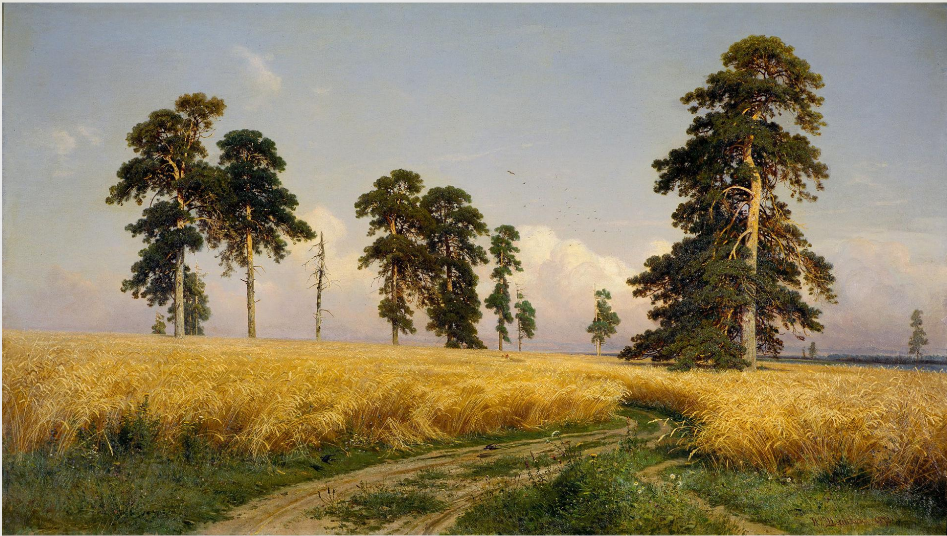
A Rye Field