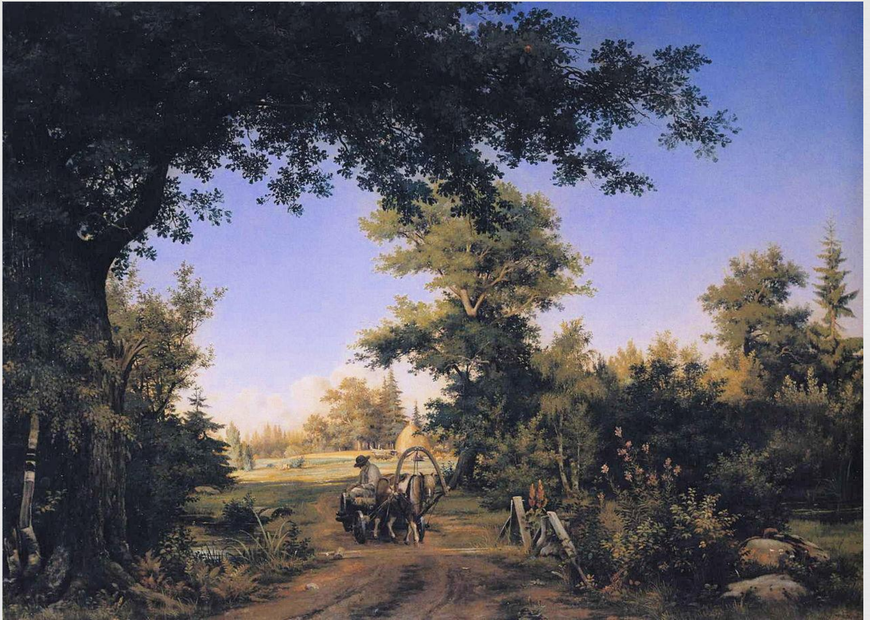
View on the Outskirts of St. Petersburg