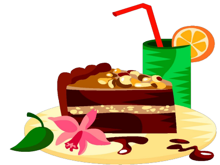
a holiday dinner