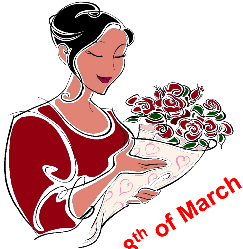
the 8 th of March