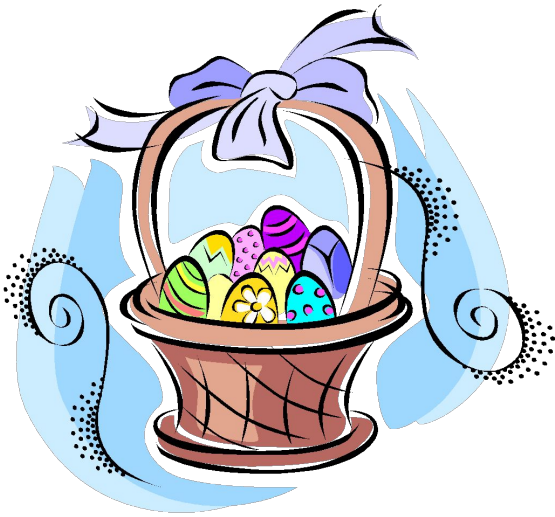
a basket of eggs