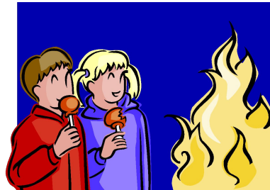
the figure of the winter