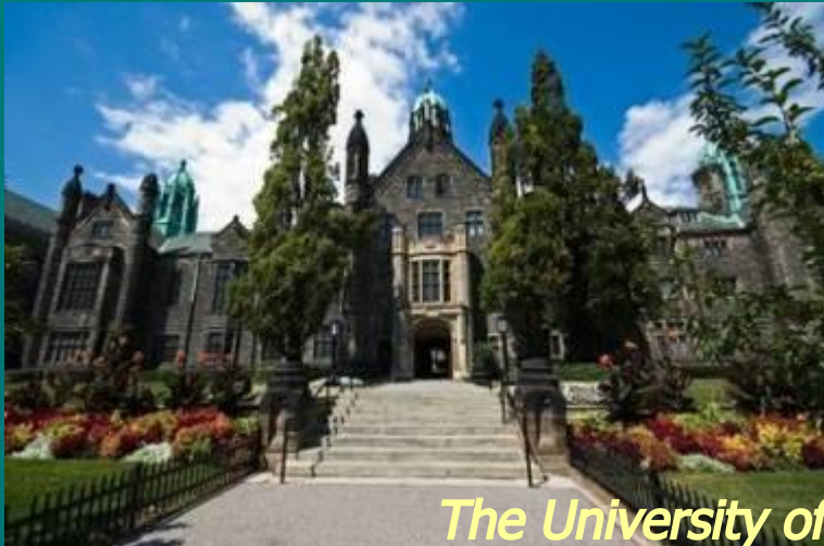
The University of Toronto