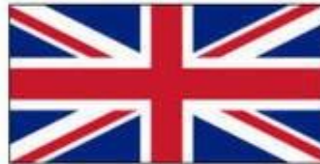
Current Union Flag (1801)