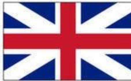
Original Union Flag (1606)