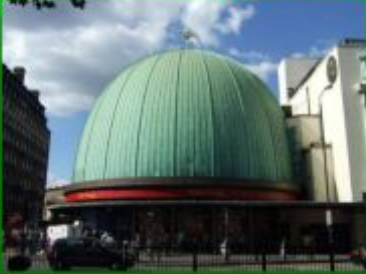
Madame Tussaud's Museum