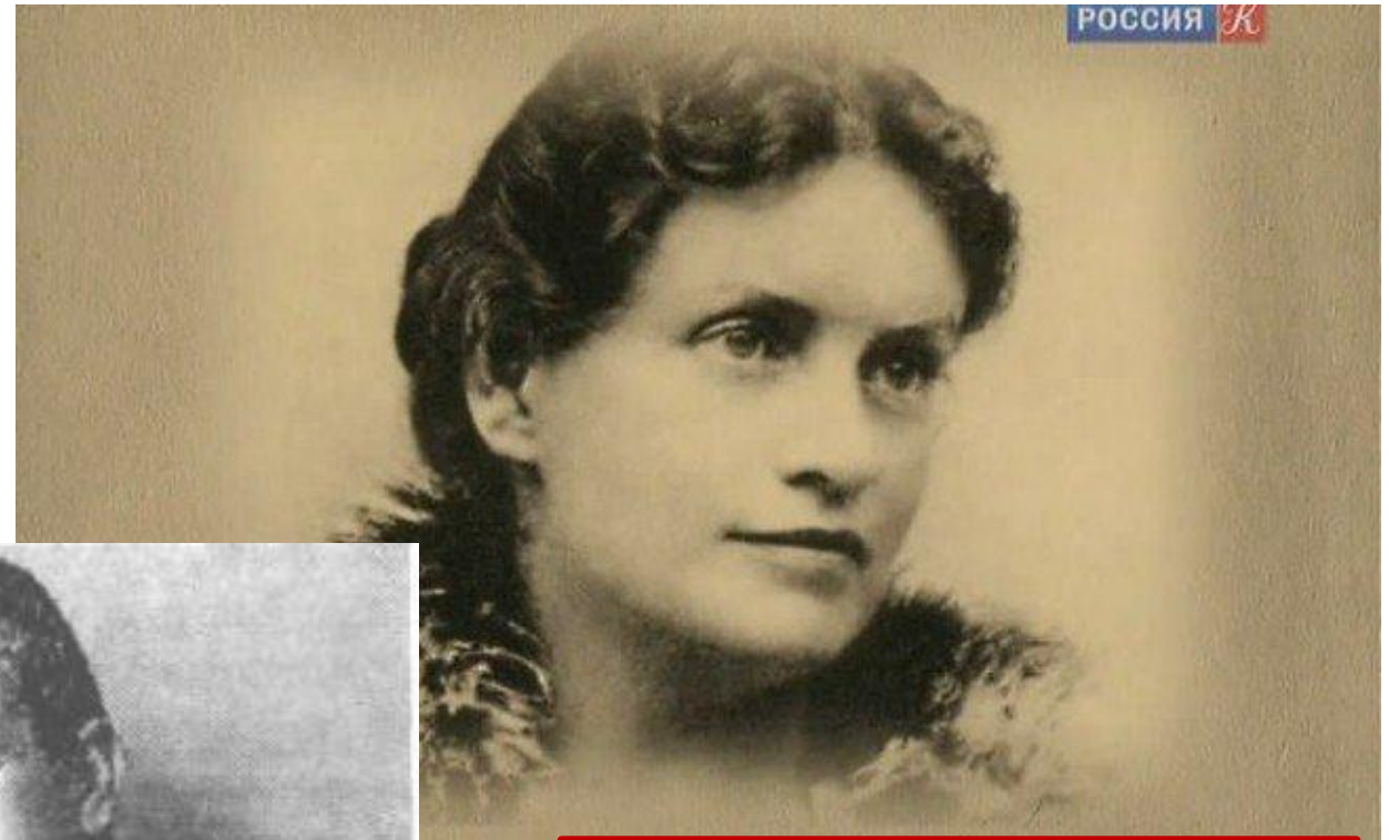
Sabina Spielrein (1904-1909)