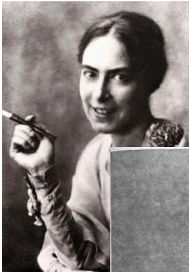
Toni Wolff (1910-1950?)