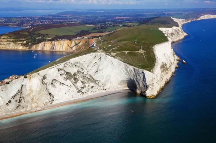
Isle of Man