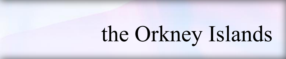
the Orkney Islands