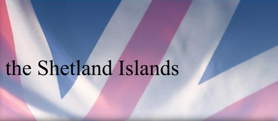
the Shetland Islands