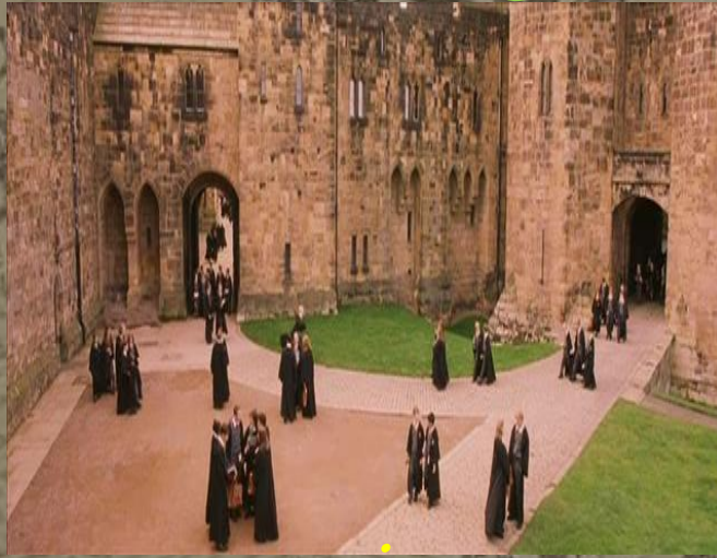
a magic square