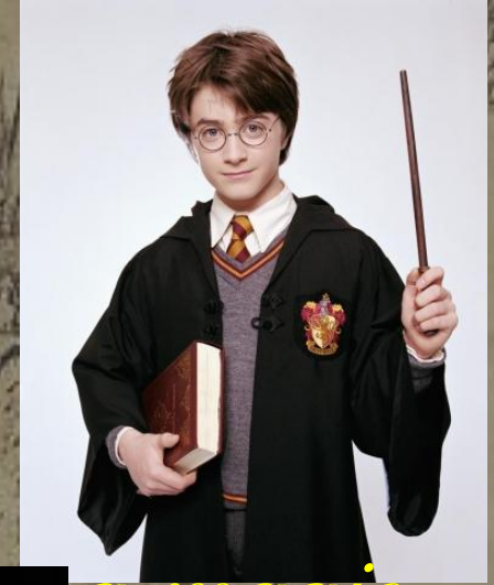
a magic boy