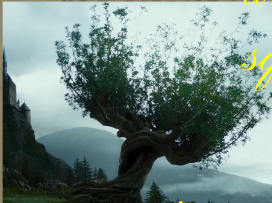
a magic tree