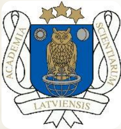
Institute of Economics, Latvian Academy of Sciences (Riga, Latvia)

Recently, Department of Management and Logistics signed new cooperation agreements with leading universities in Europe: