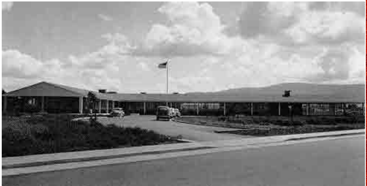
The First building of Silicon Valley First Varian Associates building, Stanford Industrial Park, Palo Alto, California, 1953.