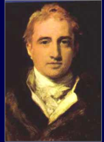
Foreign Minister, Viscount Castlereagh (Br.)