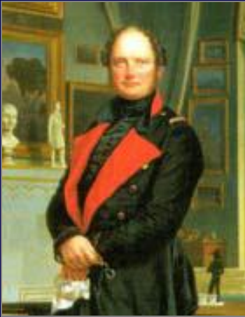
King Frederick William III (Prus.)