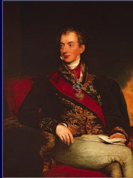
The "Host" Prince Klemens von Metternich (Aus.)