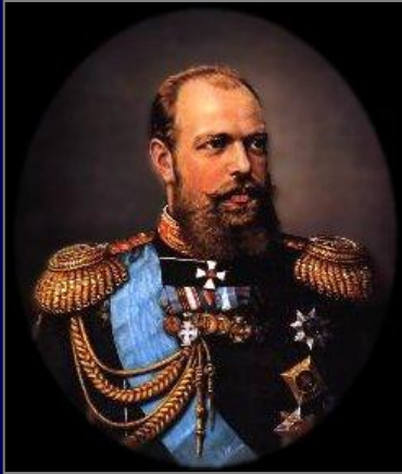
Tsar Alexander I (Rus.)