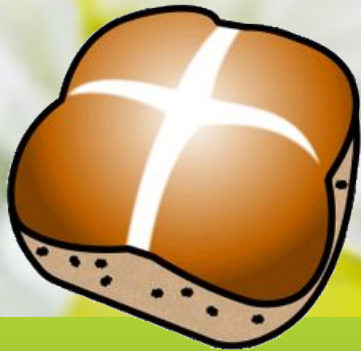
hot cross bun