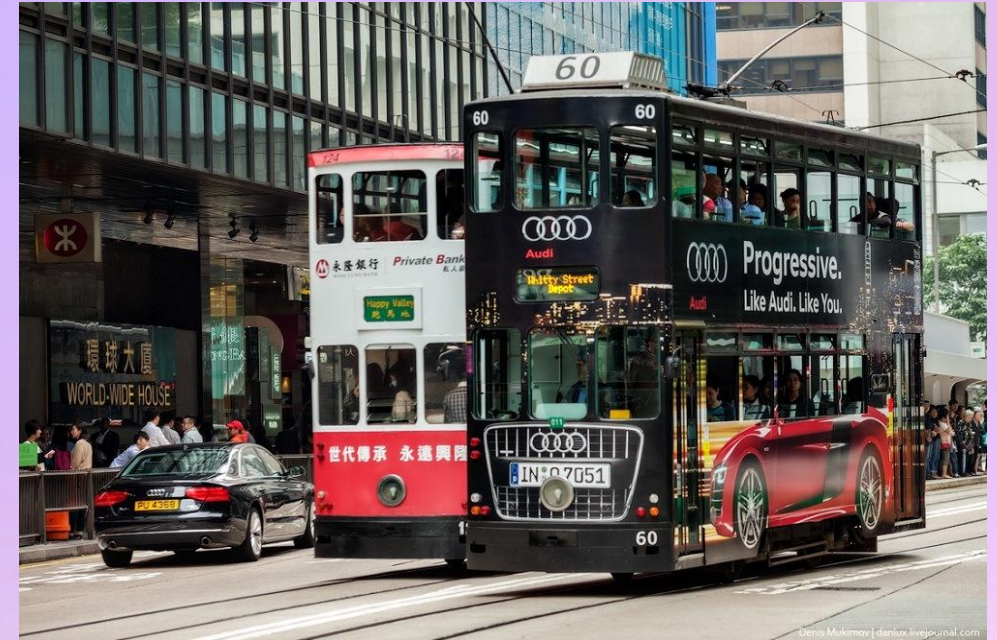
Hong Kong Tram

At each public transport stop and metro stations there is information about the fare for passing routes. The fare depends on the distance, the carrier's company and the comfort of transport.