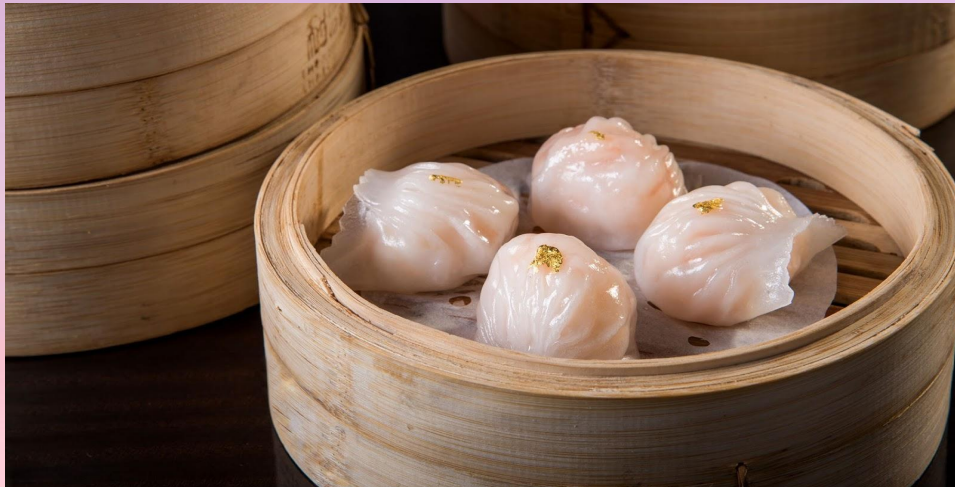
steam dumplings dim sum