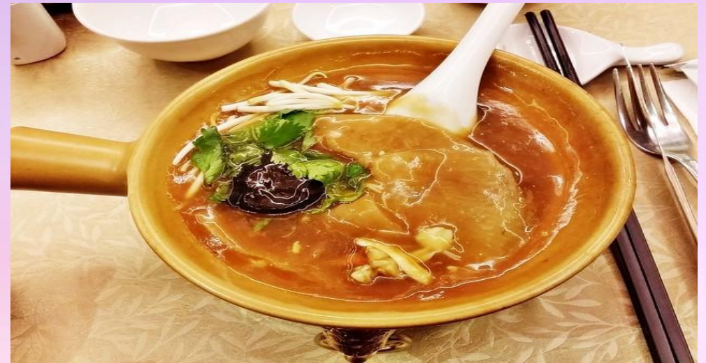
shark fin soup