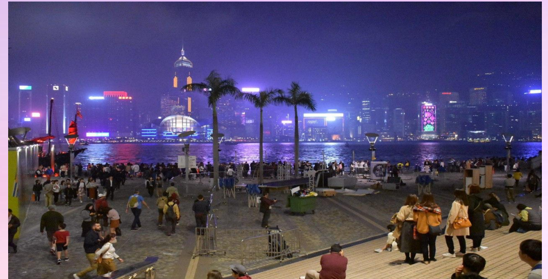
Tsim Sha Tsui Tsim