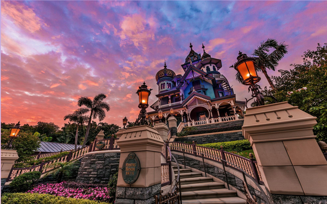
Disneyland on Lantau Island