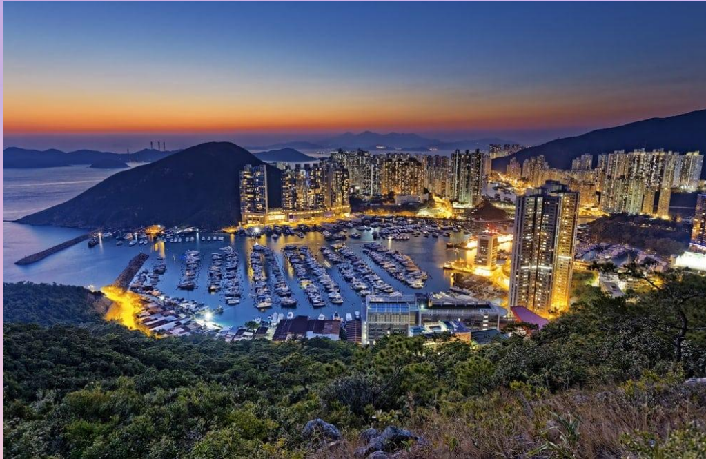
The Aberdeen area