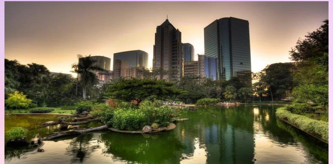
Kowloon Island Park