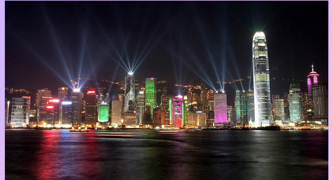
Symphony of Lights