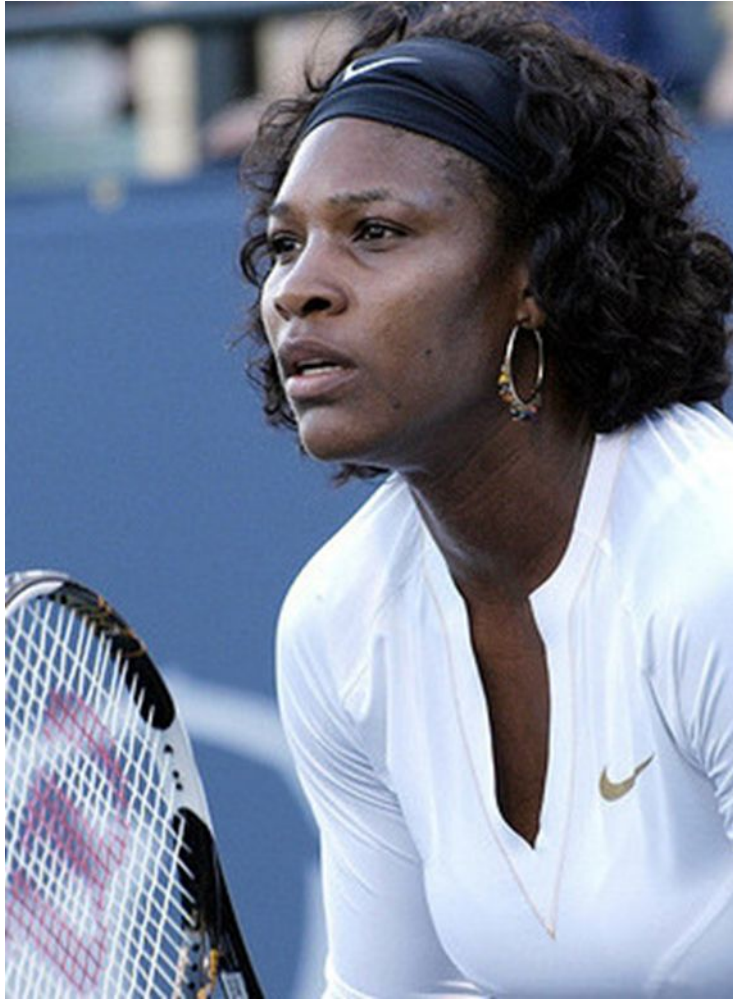
She's Serena Williams.