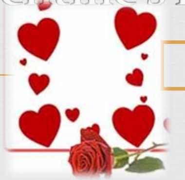
Valentine's Day Hearts