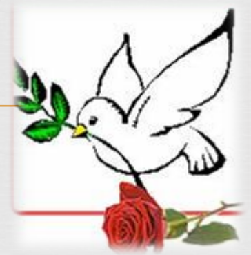
Lovebirds & Doves