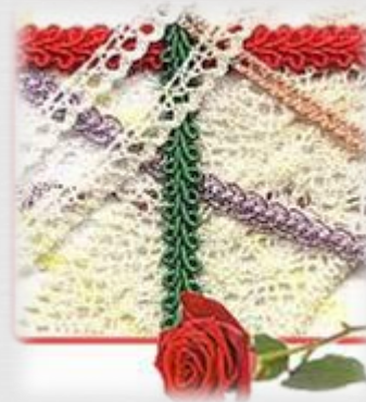
Valentines Day Lace