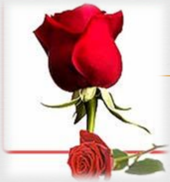
Valentine's Day Roses