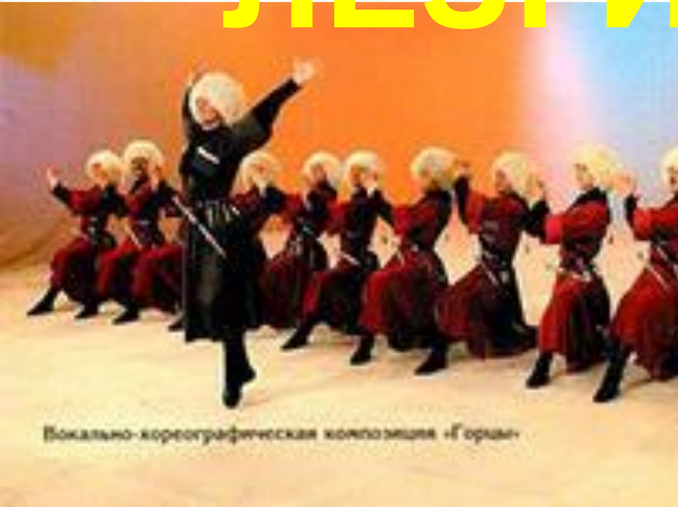
Вокально-хореографическая композиция «Горцы»