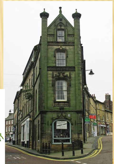
The Tall Green Shop