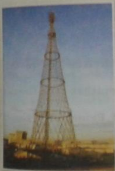
One of Shukhov's towers

I respect Leonid Roshal.* He is the most famous children's doctor in Russia. He helped many children in . Doctor Roshal children in dangerous places. For his and for his he got many awards: the European of the Year in 2005, the Doctor of Peace 1 and a National of Russia. In 1996 he became the Doctor of the World. For me, Doctor Roshal is an example to follow.