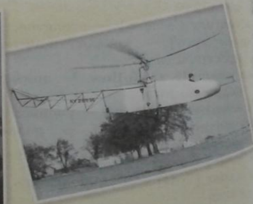
One of Sikorsky's helicopters