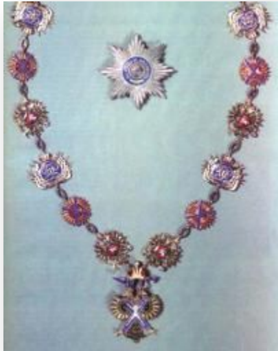
St Andrey Pervozvanny order