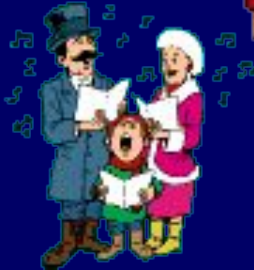
To sing carols