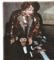
chimp/play the piano