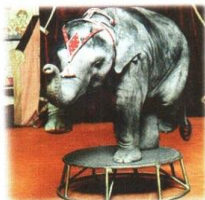
elephant/stand on two legs

1 Look at the pictures and say what the animals can do.