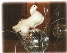
pigeon/walk on the ball