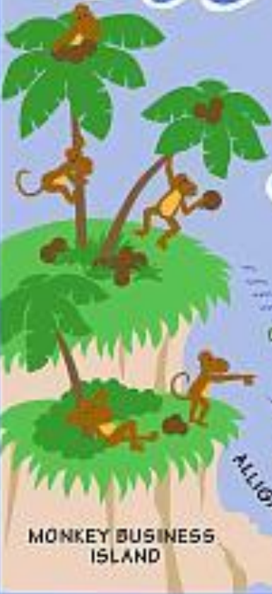
MONKEY BUSINESS ISLAND