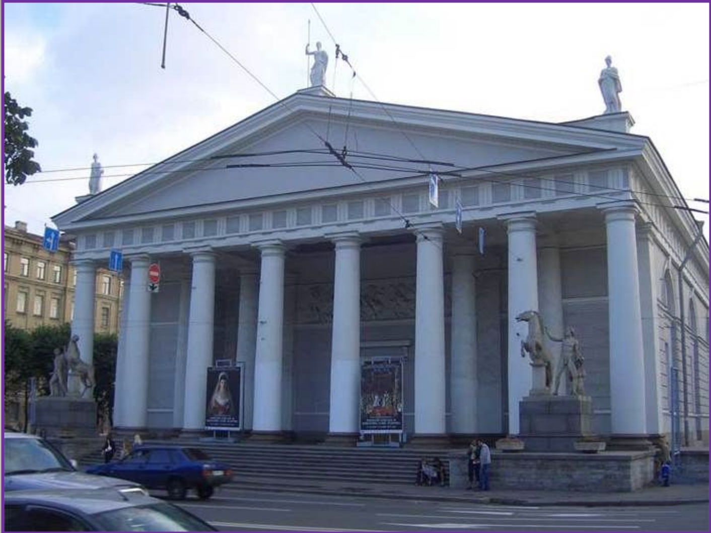
The building is situated in the south-western corner of St. Isaac's Square