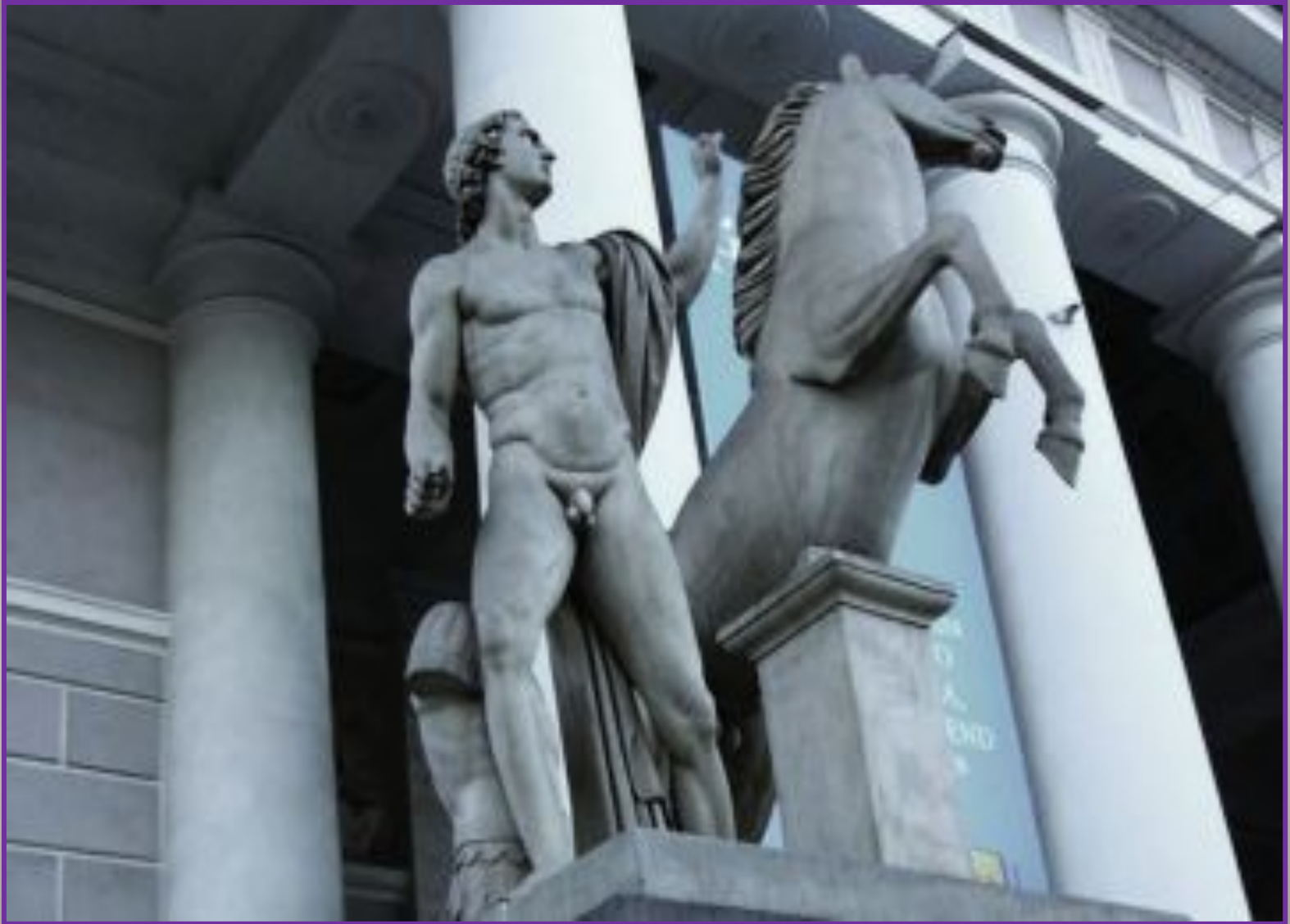
The stairs are graced with two marble sculptures of Dioscuri.