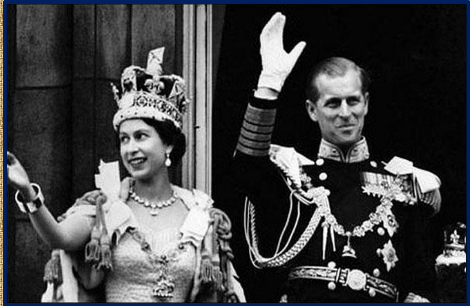
Queen and her husband prince Philip Duke of Edinburgh