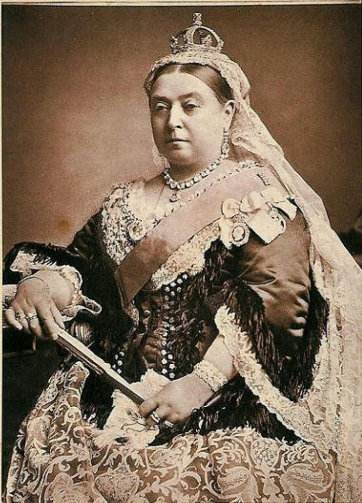
VICTORIA QUEEN OF GREAT BRITAIN G. R. & CO. LONDON. EMPERESS OF INDIA 1837—JUBILEE—1887.

Britain became a rich industrial country with a developed trade, an empire with a lot of colonies.