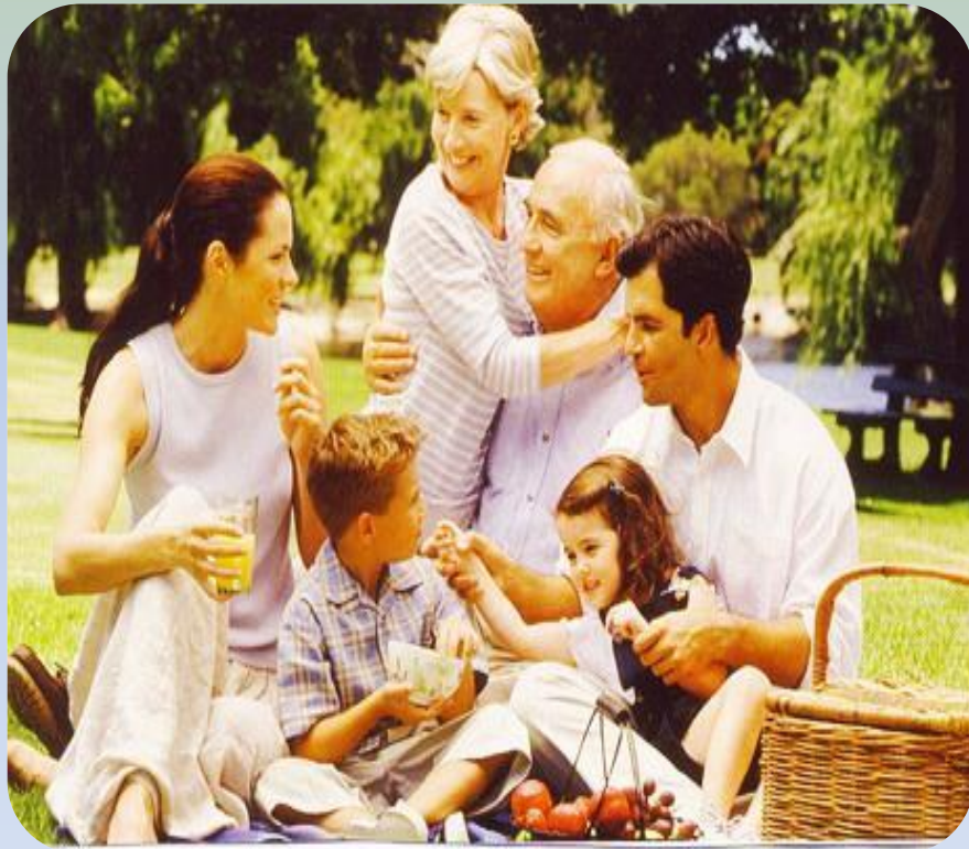
The extended family.

There used to be mainly two types of families: the extended and the nuclear (core) family.