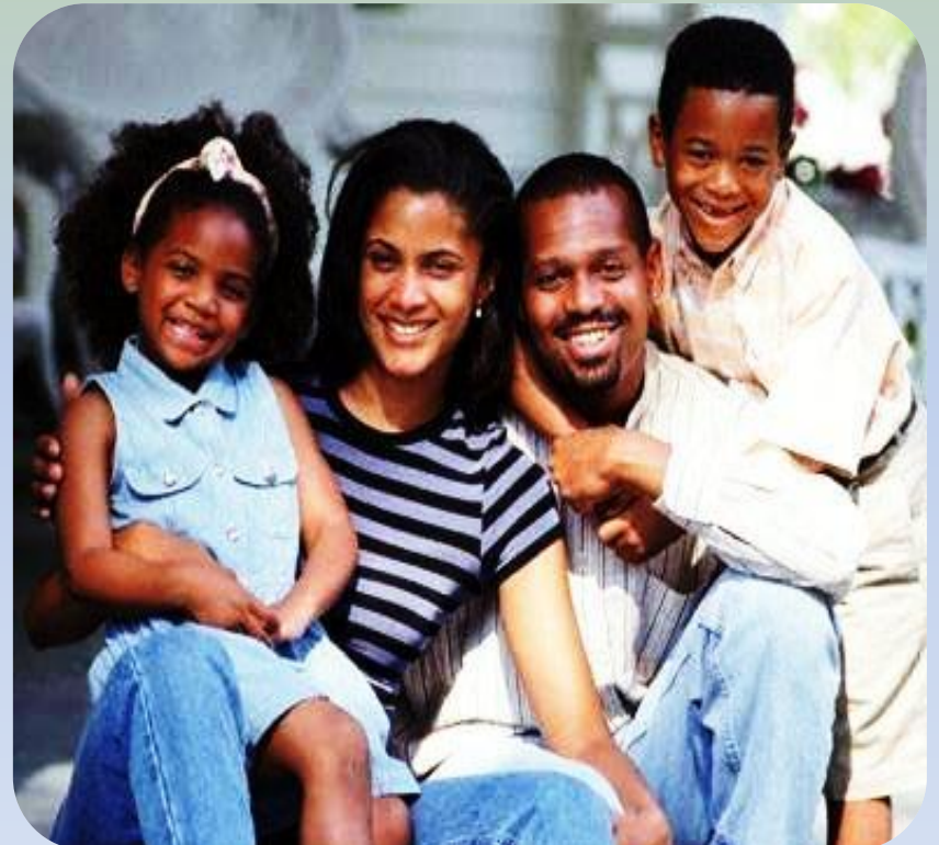
The nuclear (core) family.