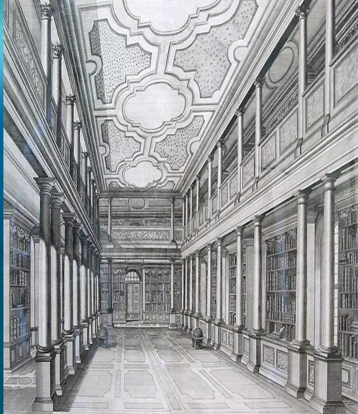
Перспективный вид библиотеки ки императорского университета в Петербурге Perspectivischer aufriß von der Bibliothek des zweiten und dritten Stockwerks Prospect de la Bibliothèque qui se au second et troisième étage Scenographia penetralium Biblio- thecae in secunda et tertia conti- gnatione

In 1836, on the base of the Kunstkammer collection several Academic museums were created.