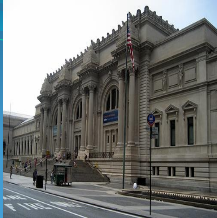
Metropolitan Museum of Art