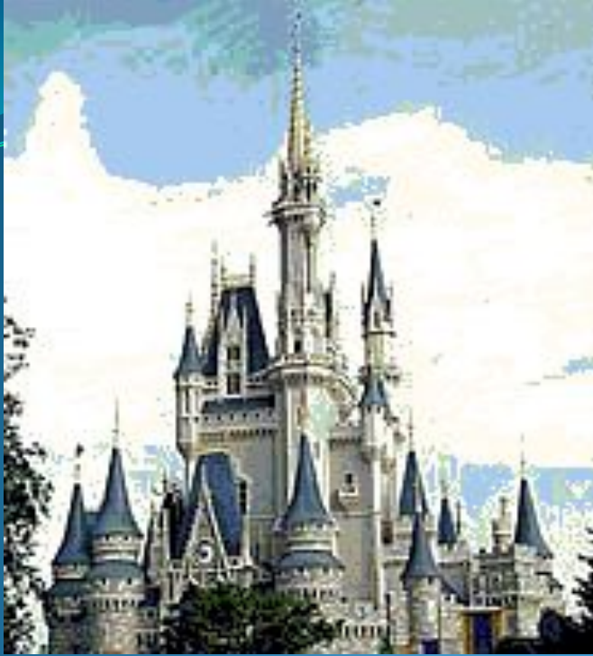
A new Disneyland in Florida