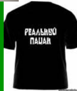
T - shirt