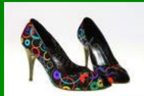
High heels shoes