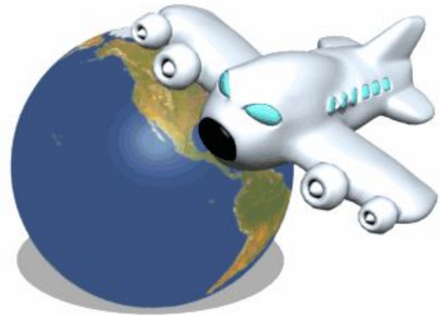
Tom's plane Tom