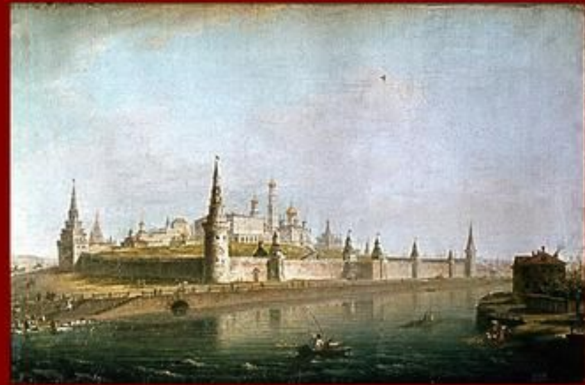
THE RISE OF MOSCOW