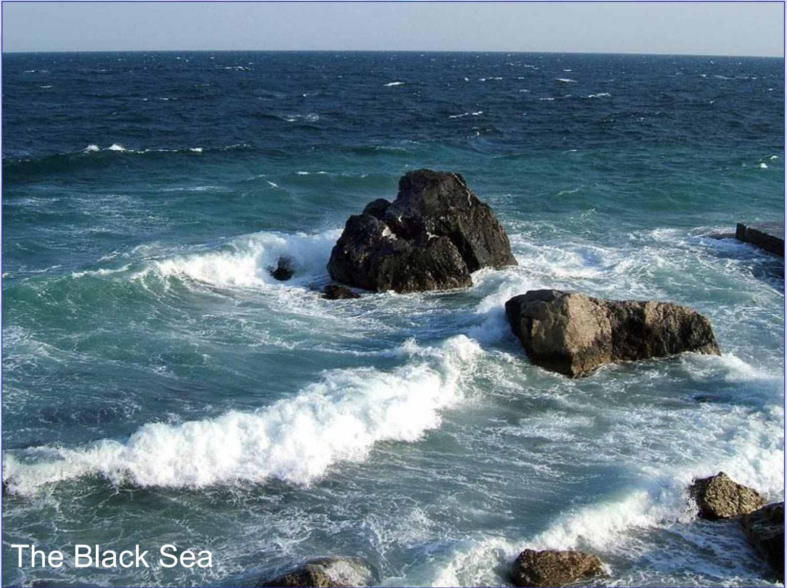
The Black Sea