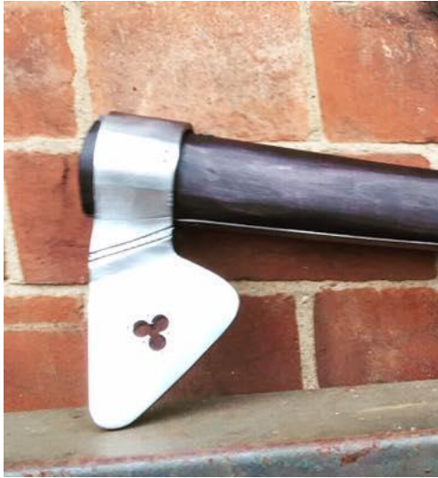
Angle of striking part