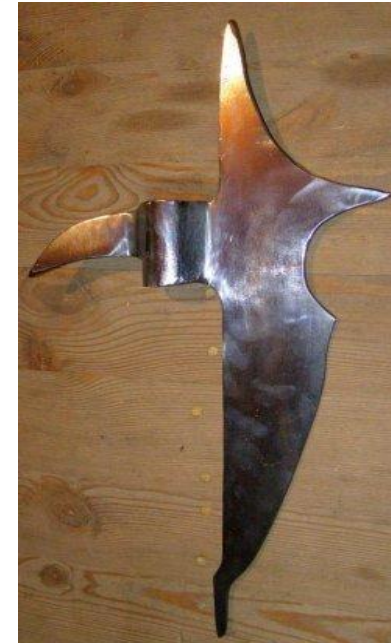
Weapon with spikes