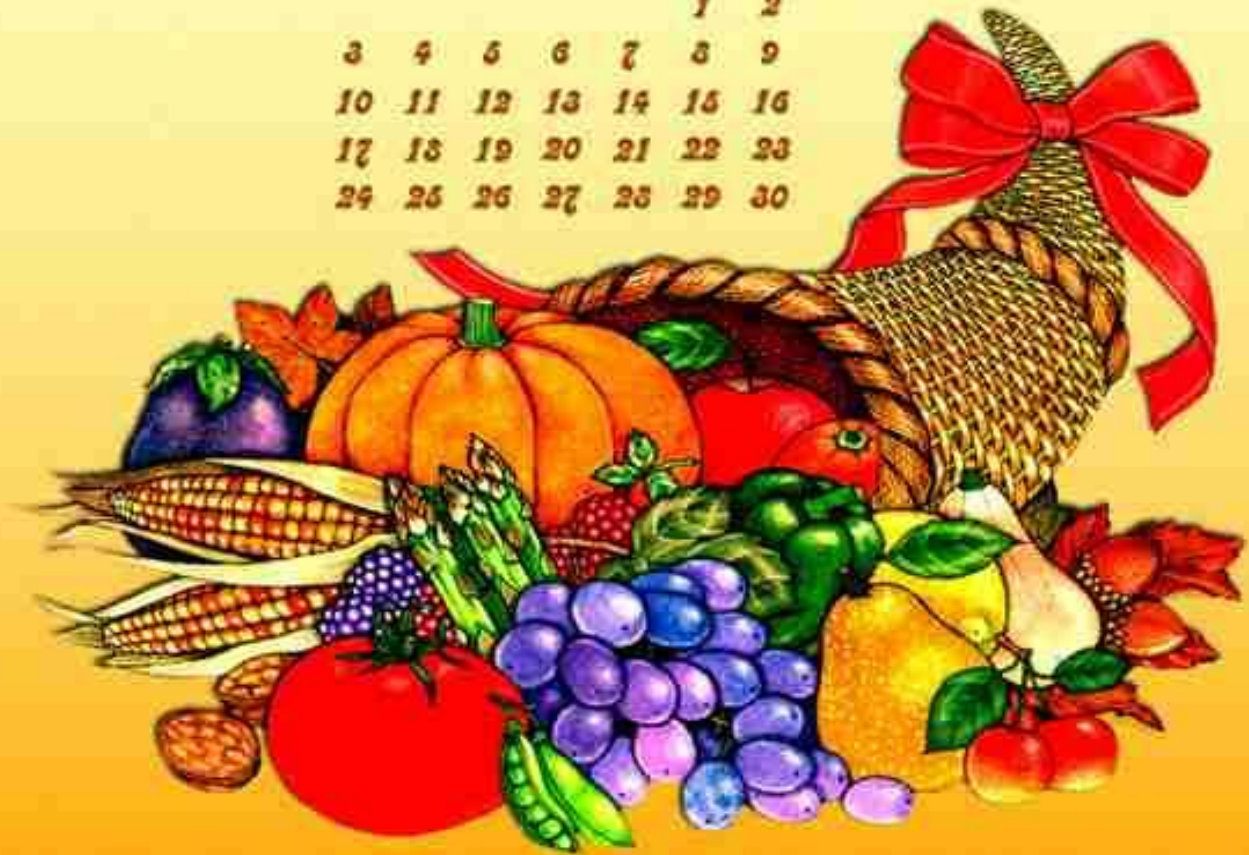
Illustration by [unreadable]