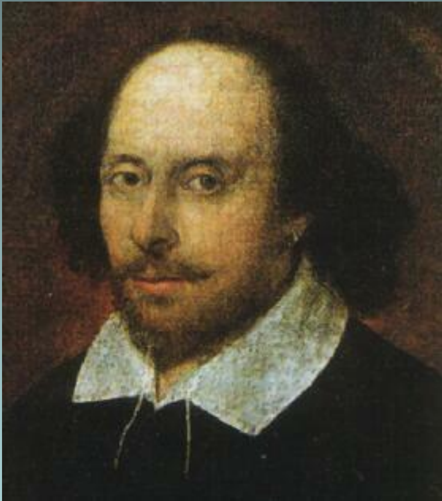
William Shakespeare (1564-1616)