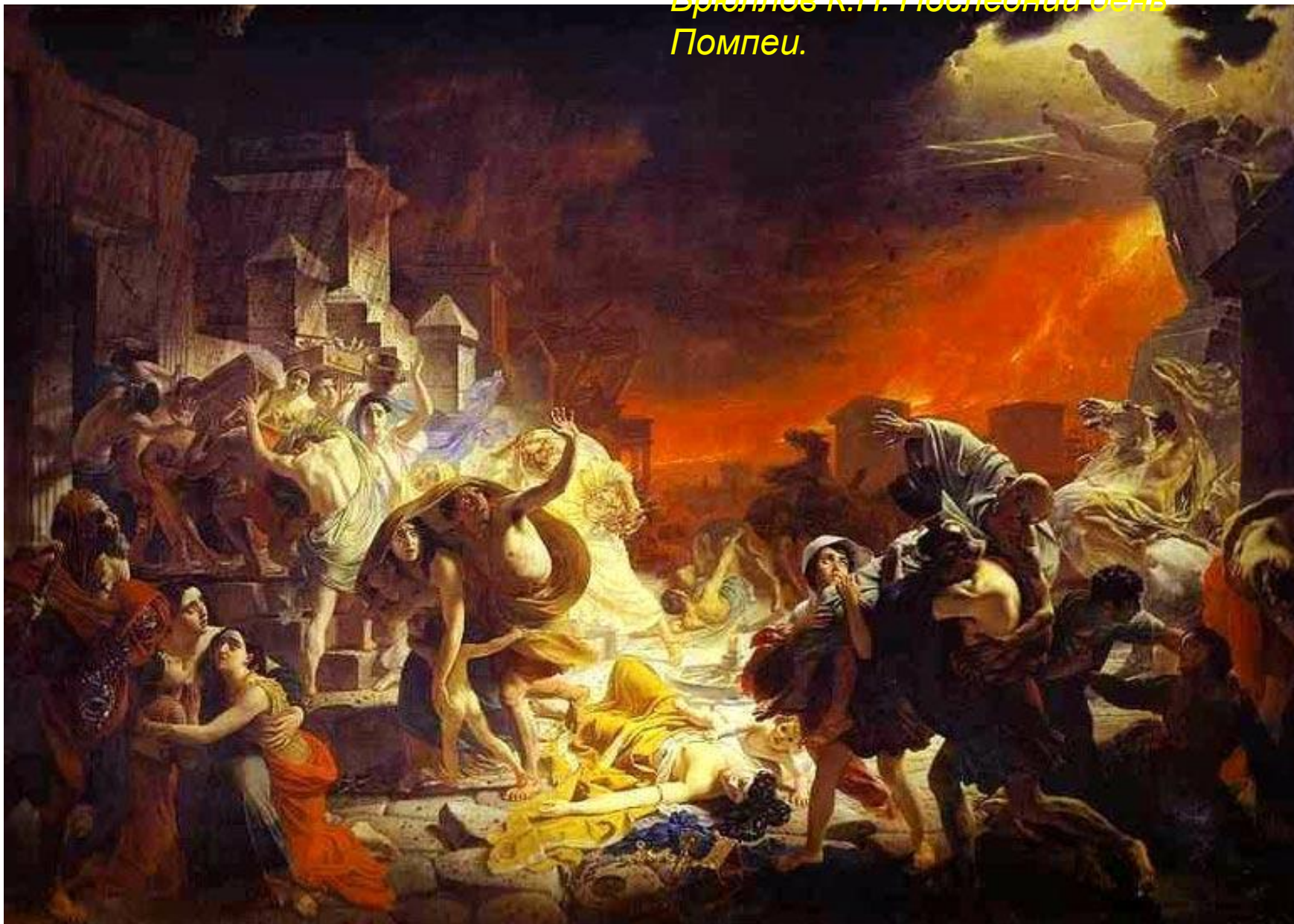
Брюллов К.П. Последний день Помпеи.