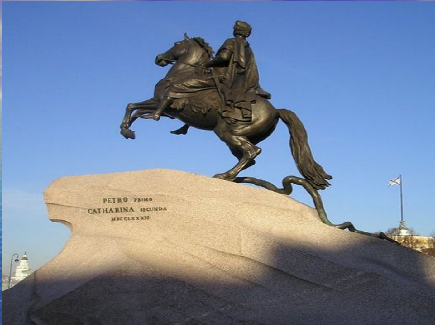
Famous monument Bronze Horseman (Peter the Great monument)