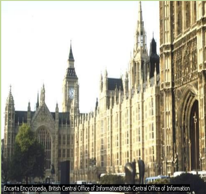
Encarta Encyclopedia, British Central Office of InformationBritish Central Office of Information

The seat of the British government is in London in the Houses of Parliament, officially the New Palace of Westminster. Parliament consists of the House of Lords and the House of Commons. The current building was built in the mid-19th century and was designed by British architect Sir Charles Barry.