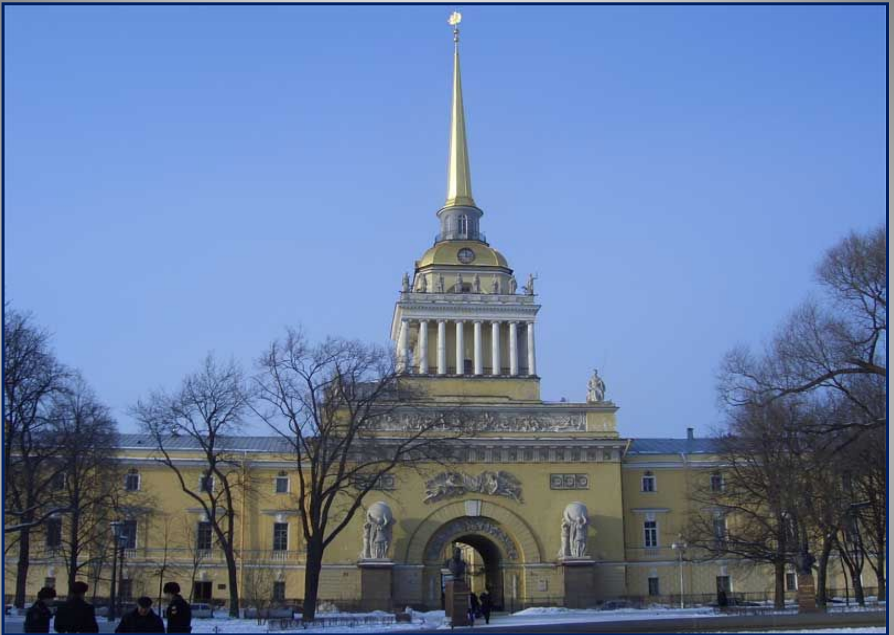
In the centre of the façade there is a tower with an entrance arch.