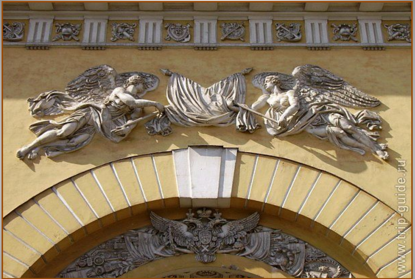
Two Geniuses of Glory are above the arch.