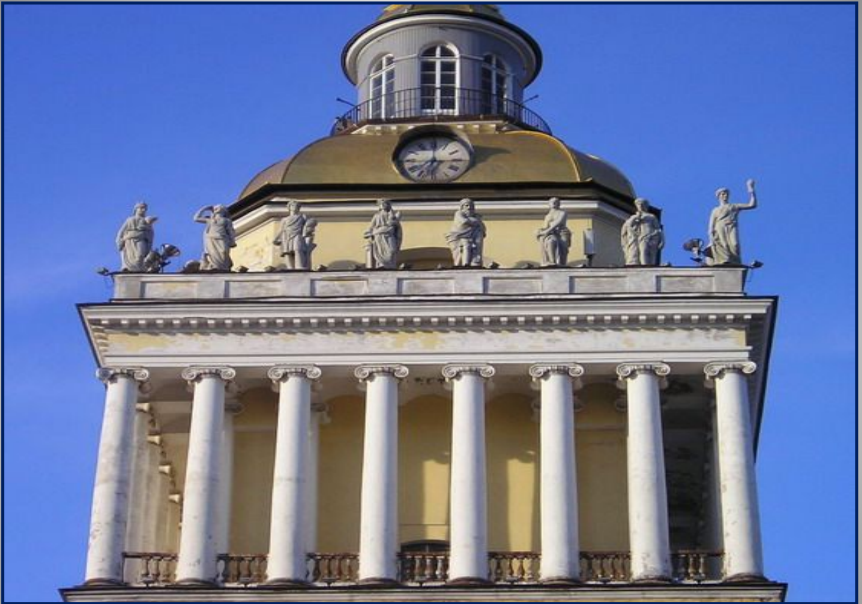
The colonnade circling the base of the spire is decorated with 28 statues.