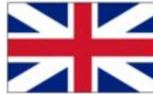
Original Union Flag (1606)