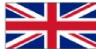
Current Union Flag (1801)