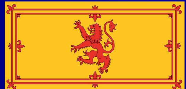
The Rampant (стоящий на задних лапах) Lion flag