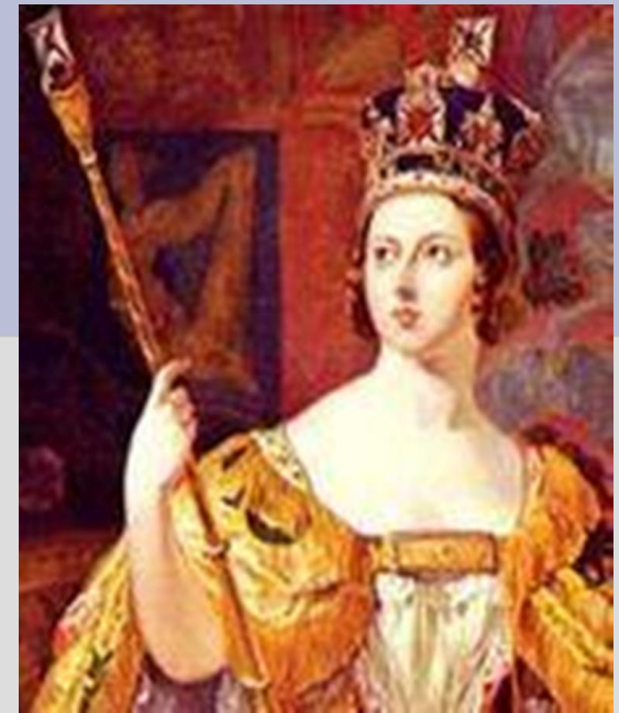
Queen Victoria and Windsor Castle