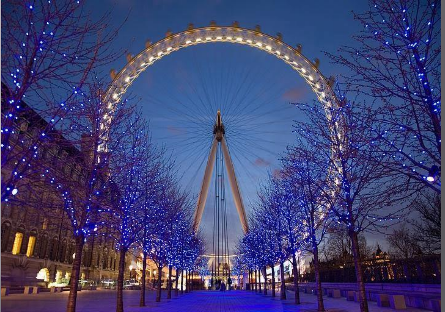
The London Eye