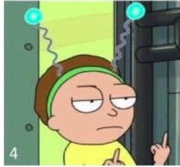
Not amused Morty