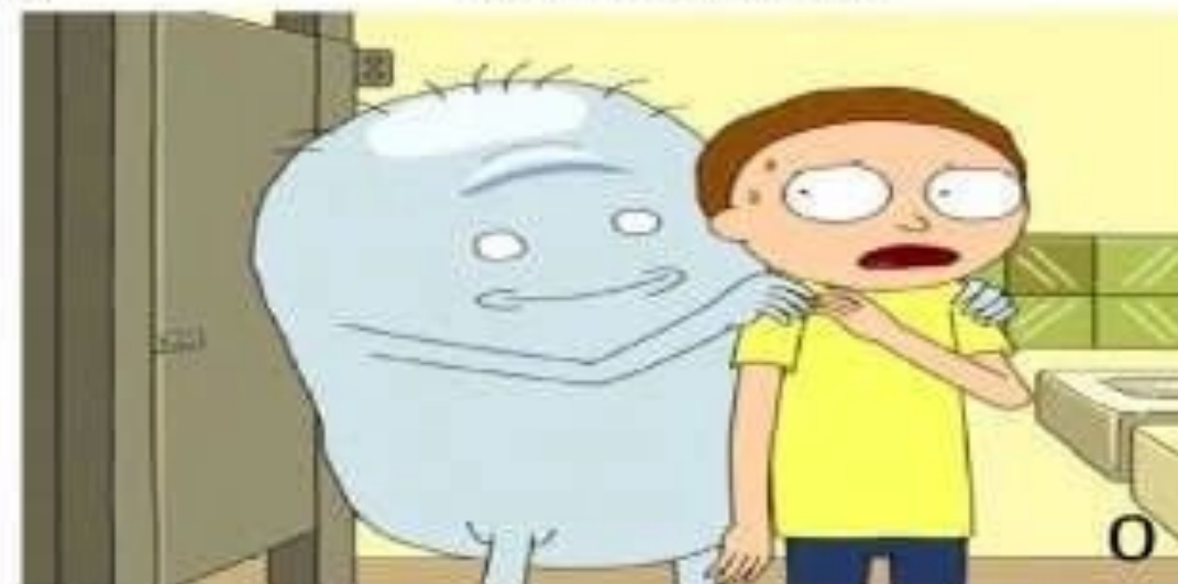
Sexually harassed Morty