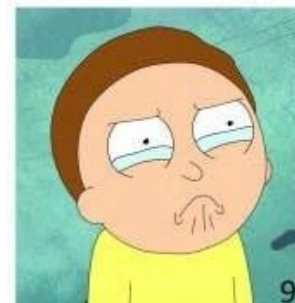
Really mad Morty