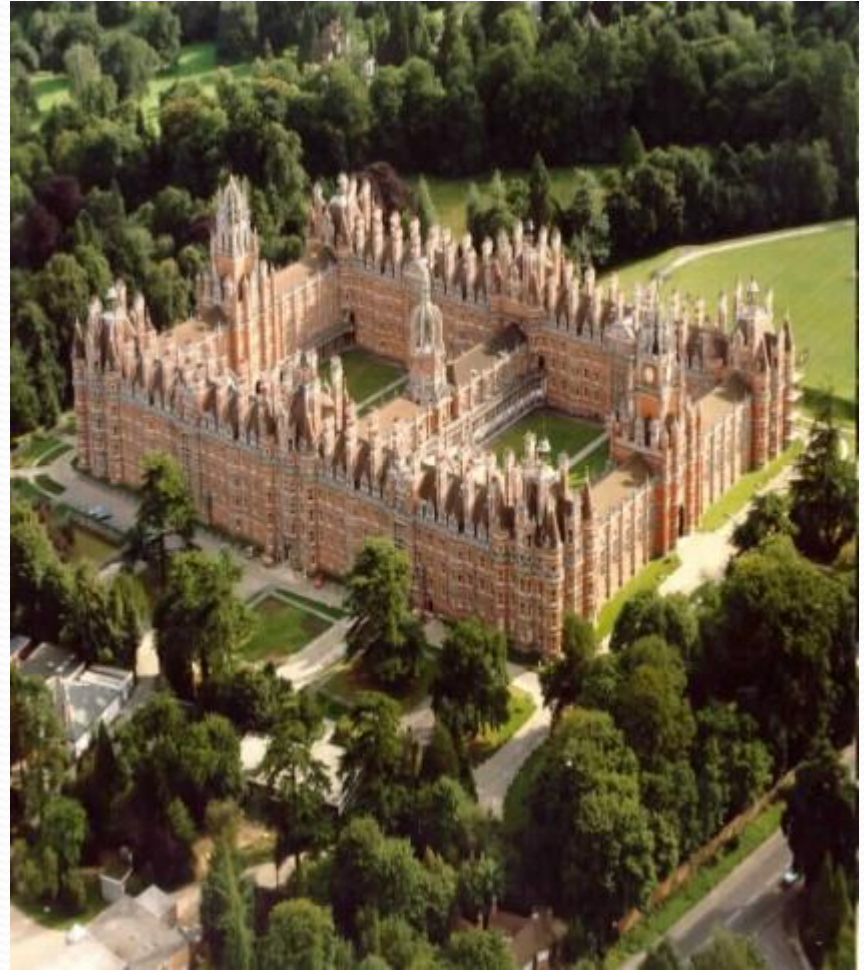
University of London.

Following two years of study, students may take A-Level (short for Advanced Level) examinations, which are required for university entrance in the UK.