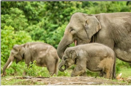
Sumatran elephant - Суматранский слон