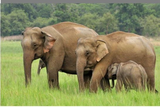
Asian elephant - Азиатский слон