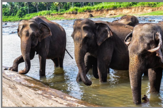
Sri Lankan elephant - Шри-ланкийский слон