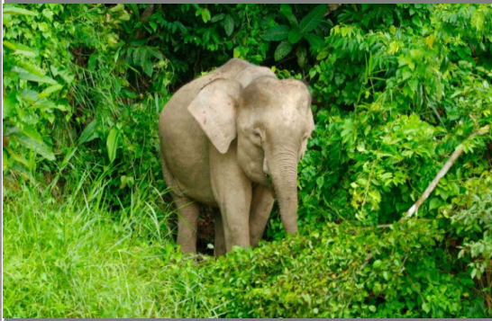
Borneo elephant - Борнейский слон