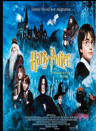
Harry Potter and the Philosopher's Stone