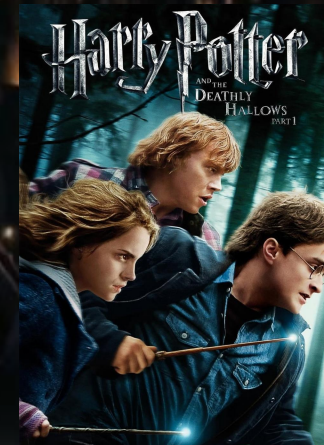
Harry Potter and the Deathly Hallows Pt.1