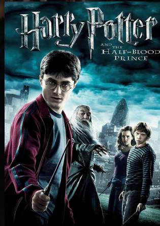
Harry Potter and the Half-Blood Prince