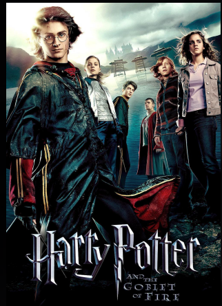
Harry Potter and the Goblet of Fire