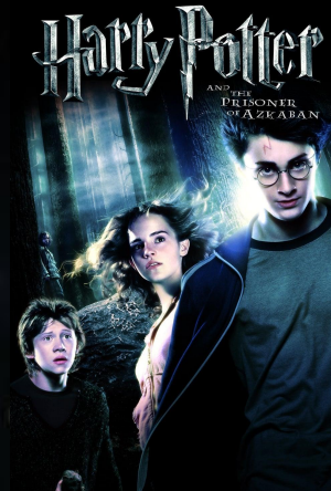
Harry Potter and the Prisoner of Azkaban