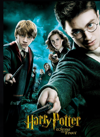
Harry Potter and the Order of the Phoenix