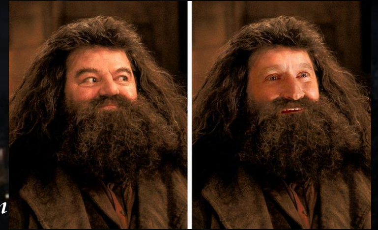
Robin Williams vs Robbie Coltrane