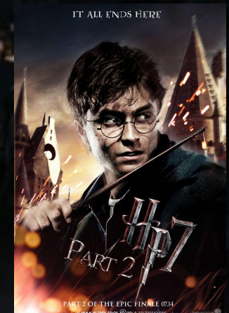
Harry Potter and the Deathly Hallows Pt.2