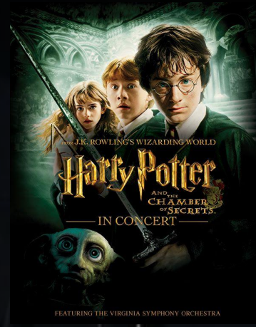
Harry Potter and the Chamber of Secrets