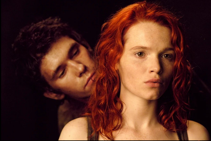
Girl from Marais street