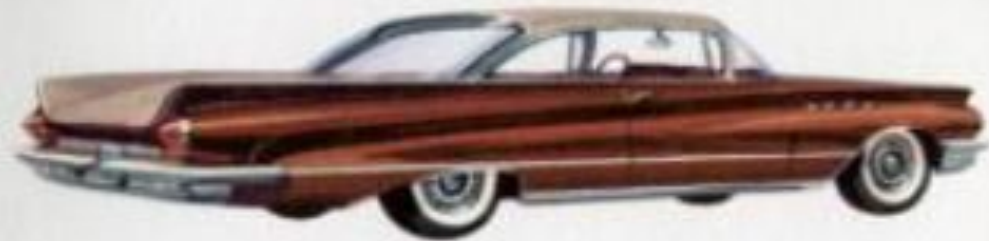
ELECTRA 2-DOOR HARDTOP in Pearl Fawn over Cordovan