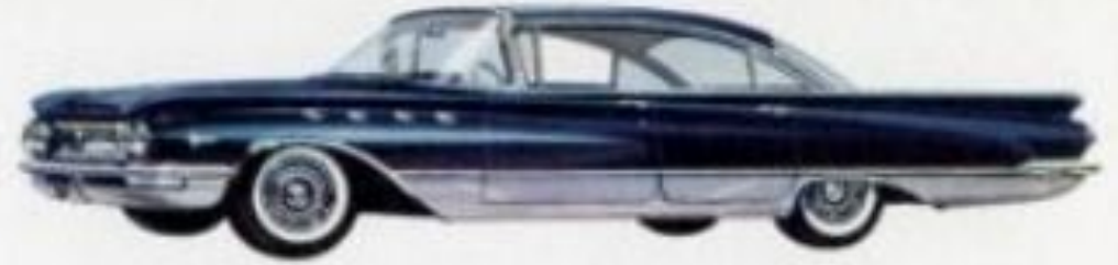
ELECTRA 225 4-DOOR RIVIERA SEDAN in Midnight Blue