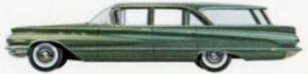
LE SABRE 2-SEAT ESTATE WAGON in Lucerne Green