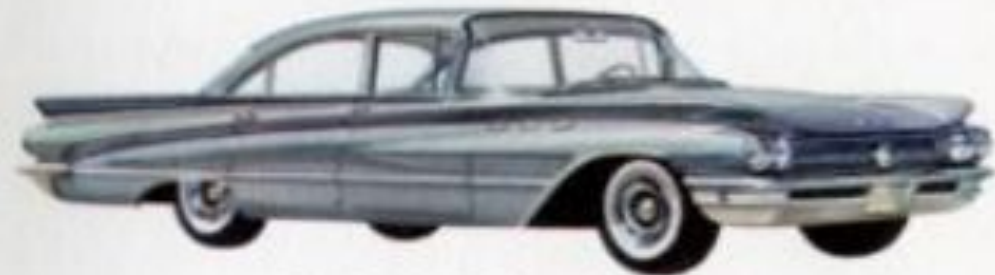
LE SABRE 4-DOOR SEDAN in Silver Mist