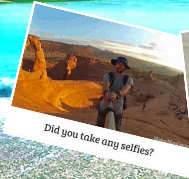
Did you take any selfies?