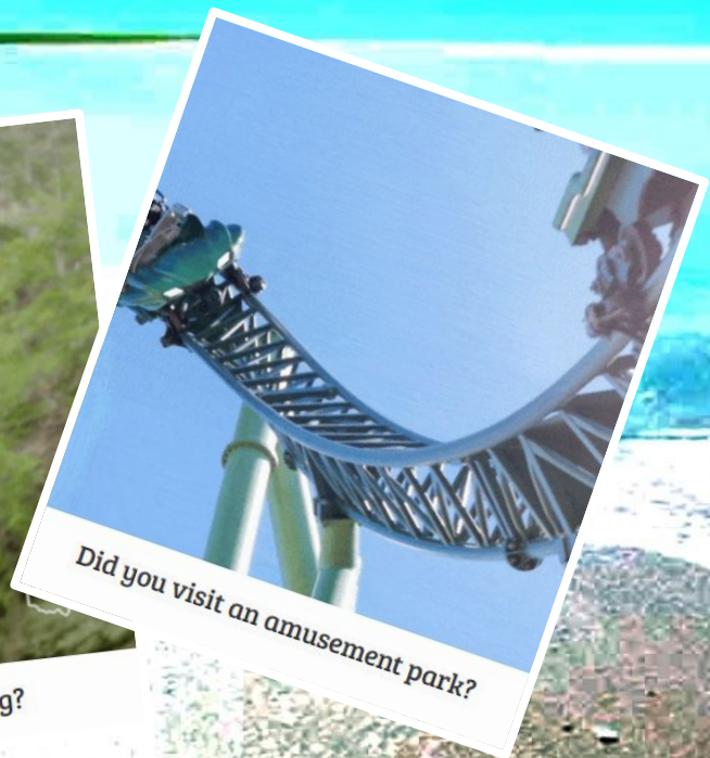
Did you visit an amusement park?