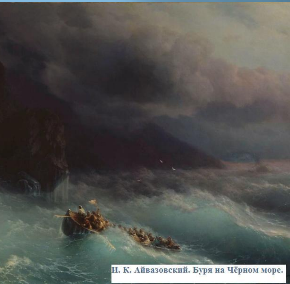
И. К. Айвазовский. Буря на Чёрном море.