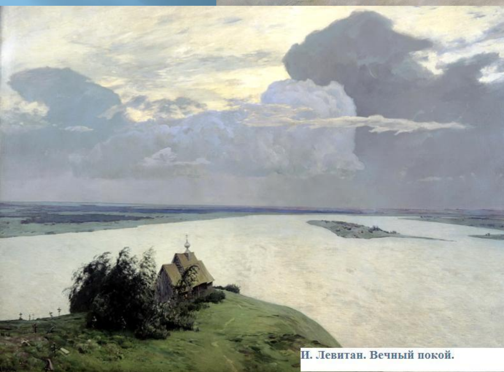
И. Левитан. Вечный покой.