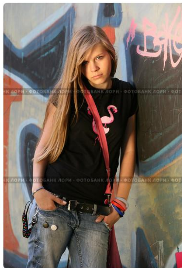
Девушка-тинейджер